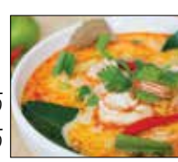
Tom Yum Shrimp Soup