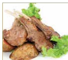
Kado Lamb Chop