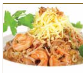
Shrimp Pad Thai