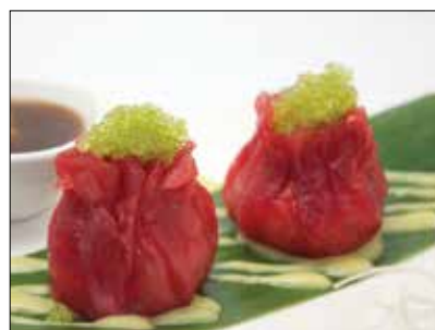
Tuna Dumpling (4pcs)