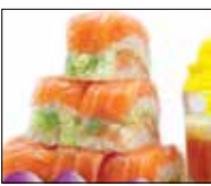
Sushi Box Cake w. Salmon