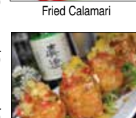
Thai Crab Cakes