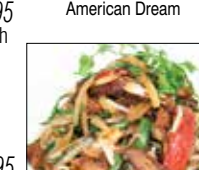
Duck Fajitas Asian Style