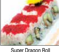
Super Dragon Roll