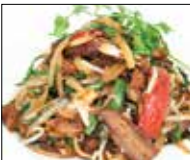
Duck Fajitas Asian Style