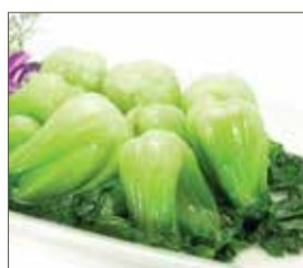
Baby Bok Choy