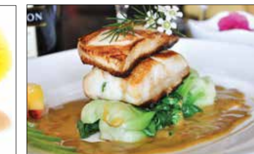
Pan Roasted Chilean Seabass