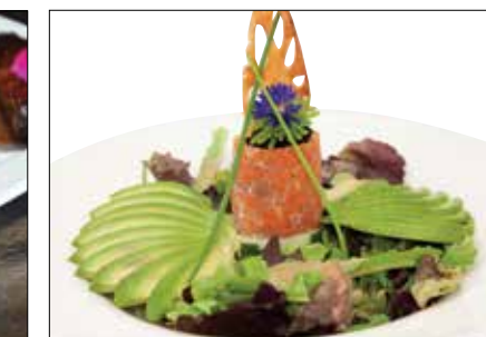
Spicy Tuna Avocado Salad