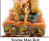
Spider Man Roll