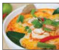
Tom Yum Shrimp Soup