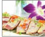
Blackend Tuna Tataki