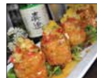
Thai Crab Cakes