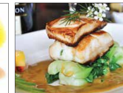
Pan Roasted Chilean Seabass