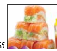
Sushi Box Cake w. Salmon