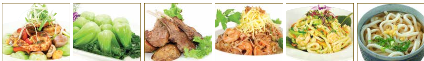
Wok Grilled Garlic Shrimp Baby Bok Choy Kado Lamb Chop Shrimp Pad Thai Shrimp Yaki Udon Udon Soup

Kado Dinner Only Max Discount $30 (Tax & Gratuity not included) 1 Coupon per table. with coupon only. (print coupon) Not to be combined with any other offer. Not Valid on Gift Certificates. Not Valid on Lunch Special