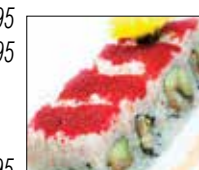
Super Dragon Roll