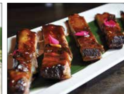
Honey Back Ribs