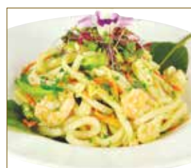
Shrimp Yaki Udon