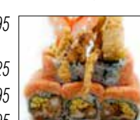
Spider Man Roll